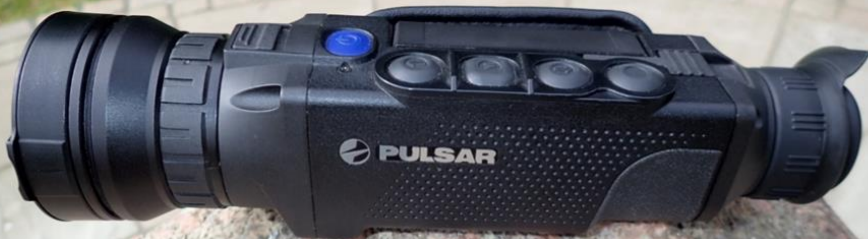
Pulsar Helion 2 XP50 Pro Thermal Camera