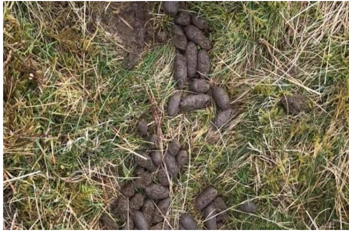
Deer droppings