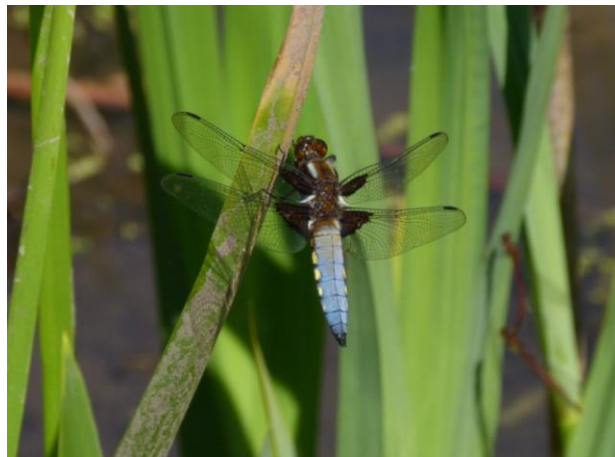
Broad bodied chaser

We asked participants for ideas for next year. They requested talks on hoverflies, molluscs, and beetles. If one of these is your area of expertise, or you can recommend someone please contact Stuart .