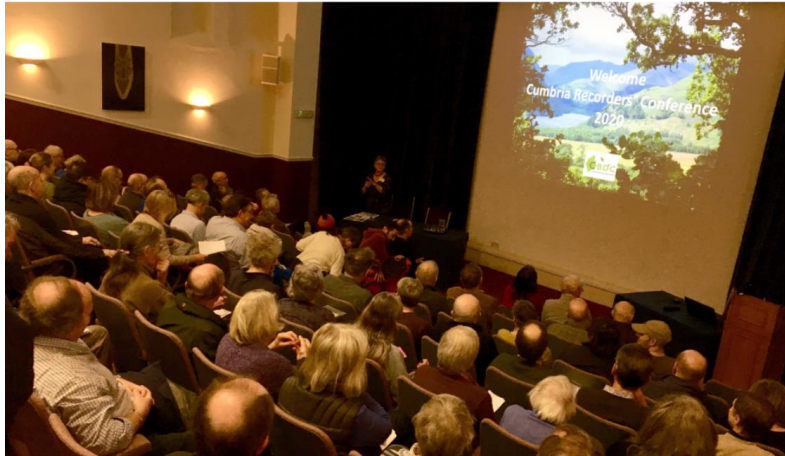
Recorders Conference 2020