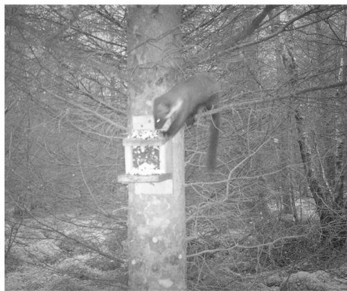
The first record of a pine marten in Cumbria, in Kershope Forest.