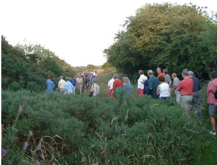
People enjoying a nature ramble at Bowness Common Nature Reserve