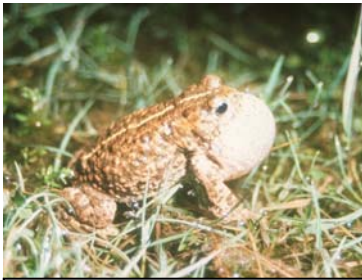
Natterjack toad male calling

West Cumbria is extremely rich in natural wonders, from the high fells of the Lake District with their moors, lakes and wetlands to the coast with vast lowland bogs and estuaries rich in birdlife. The nature conservation importance of many of these areas has been recognised by their designation as County Wildlife Sites, Local Nature Reserves (LNR), nationally important Sites of Special Scientific Interest (SSSI), and even some internationally important candidate Special Area of Conservation (cSAC), Special Protection Areas (SPA) and Ramsar sites. Many of these special areas are readily accessible and provide a chance to experience nature first-hand. So, in addition to being havens for wildlife, they provide people with the chance to stop for a moment and appreciate the natural world around them. The sense of well-being that arises from this experience is hard to beat.