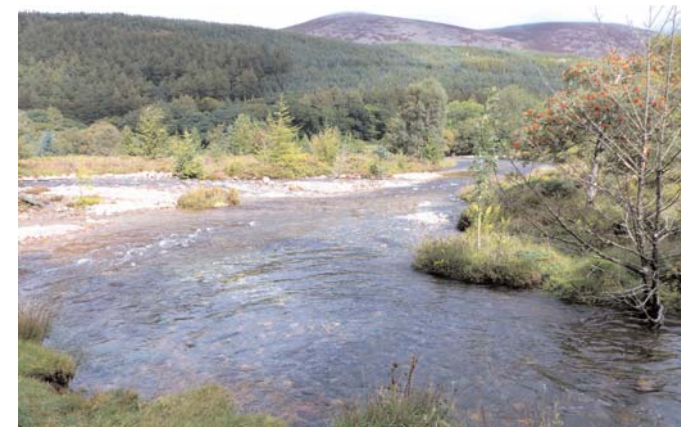
South bank of the Woundell Beck tributary flowing north into River Liza

The Liza Delta is one of around 280 LGS in Cumbria.