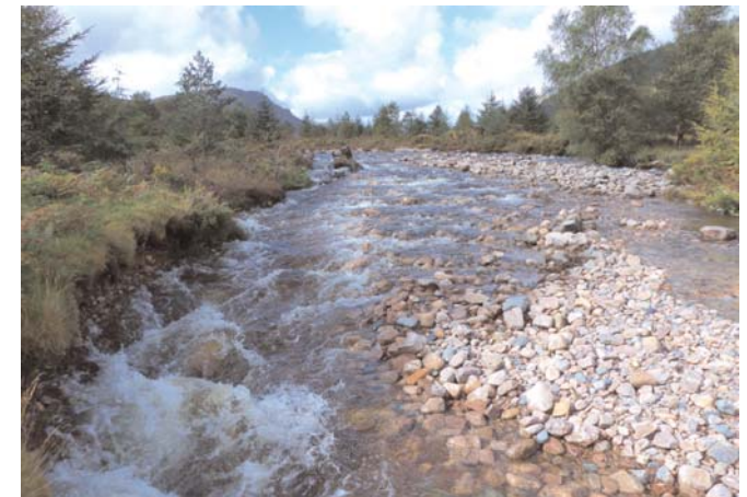
Boulders of Ennerdale Granite in Woundell Beck

For more information visit www.cumbriarigs.co.uk