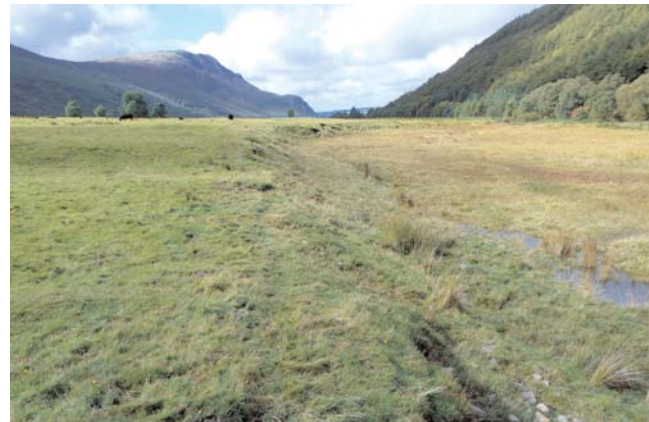
A river terrace on the Liza delta

Suitability This is a short level walk along forest tracks and footpaths, giving good views of the Liza delta into Ennerdale. Follow the valley track from the Car Park, then take the footpath (to the right) back past Low Gillerthwaite Field Centre . Cross the foot-bridge and walk across the delta fields built up into the lake by river deposits. Cross the Woundell Beck, follow the Liza Path for a short way then return by the main track.